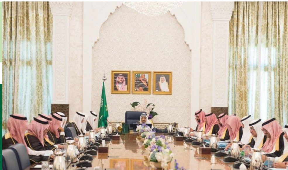
King Salman chairs the council of ministers meeting for first time in Neom, 31 July 18.

Saudi Arabia would form a higher committee for hydrocarbons to be headed by Crown Prince Mohammed bin Salman. The decision was approved in a Cabinet meeting chaired by King Salman at Neom, Tabuk region. The Higher Committee for Hydrocarbon Affairs will include the energy minister as well as the ministers of trade, finance and economy. The committee will be a reference for all hydrocarbon issues and everything relating to them and a representative of the state's rights linked to them.